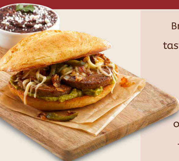
jack & annie's™ Torta Melt

WHOLE PLANT MEATS. WHOLE LOTTA MENU IDEAS.