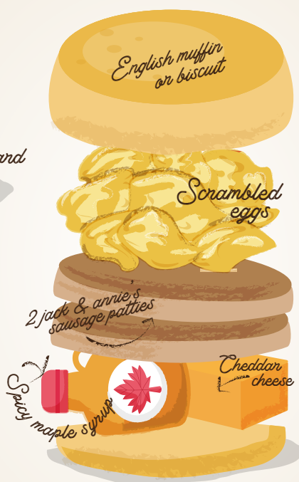
jack & annie's™ Sweet & Savory Breakfast Sandwich