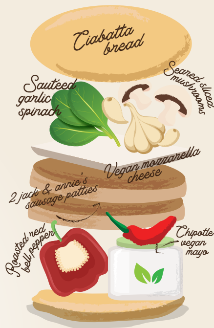
jack & annie's™ Vegan Breakfast Sandwich

Sandwich Notes: To make options vegan, substitute vegan cheese, bread and egg replacement.